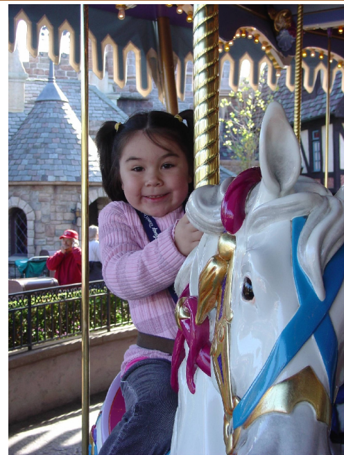
Her favorite ride overall