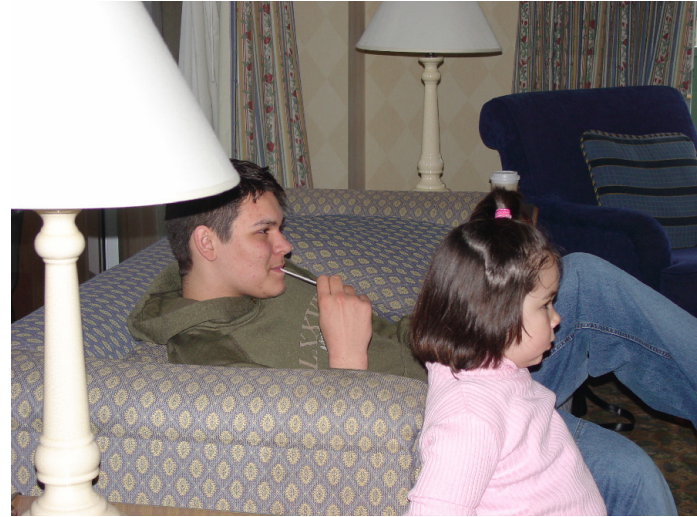
Quiet moments too...