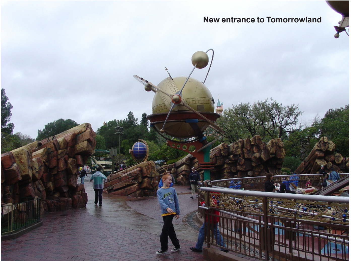
New entrance to Tomorrowland