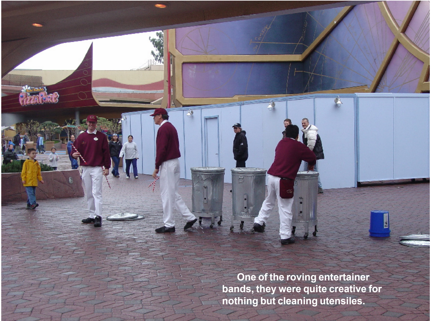
One of the roving entertainer bands, they were quite creative for nothing but cleaning utensiles.