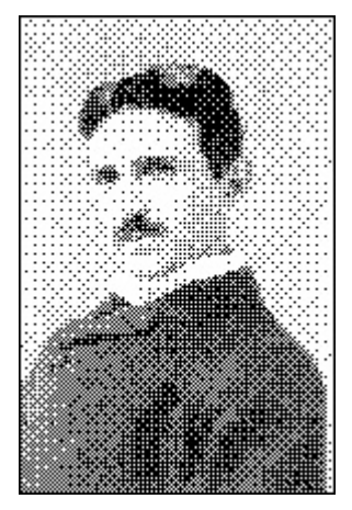
Chapter 3 How Tesla Conceived The Rotary Magnetic Fiel